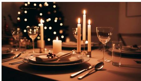
TABLE DECORATIONS HOW TO MAKE CANDLES